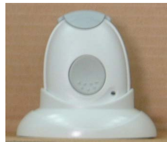
A fall pendant in its cradle

A fall pendant is an alternative to the normal pendant and is primarily designed to help anyone who suffers from blackouts or epilepsy. The fall pendant is worn on the waist and if the wearer collapses, a mercury trigger inside the pendant is set off. If the person doesn't get back up within fifteen seconds, it then puts a call through to the Control Centre.